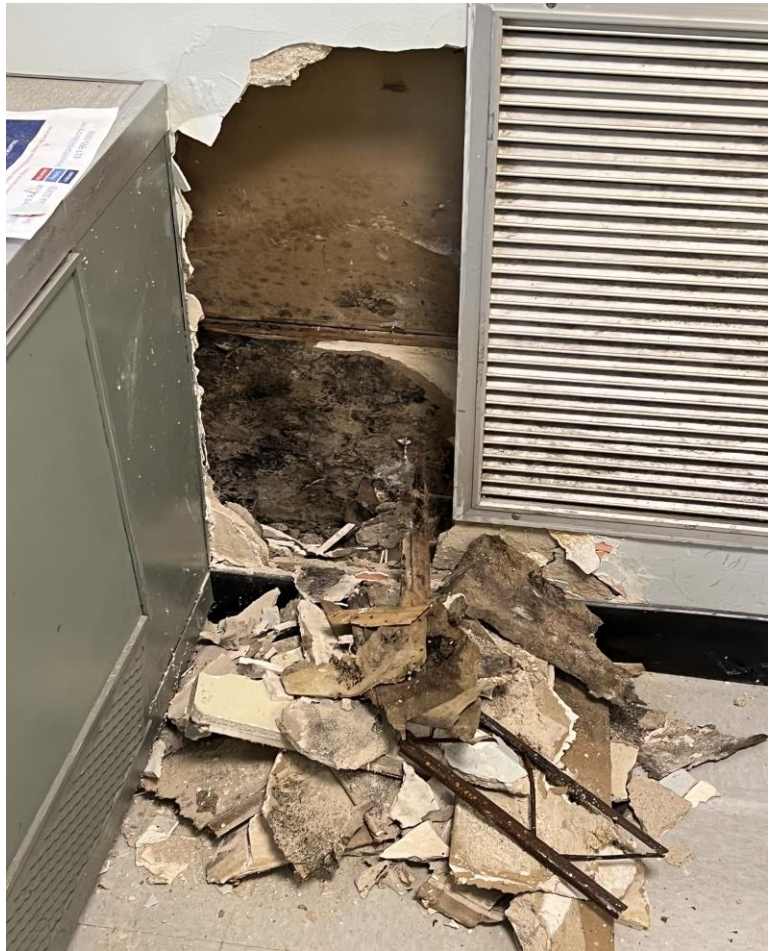
Undetected Leaks in the Walls