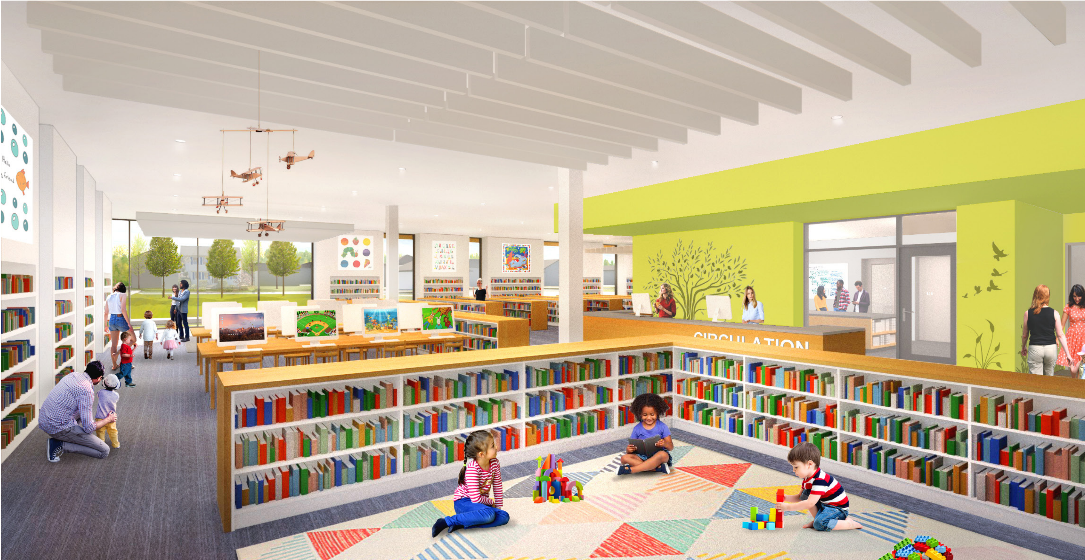
→ View of Children's Wing