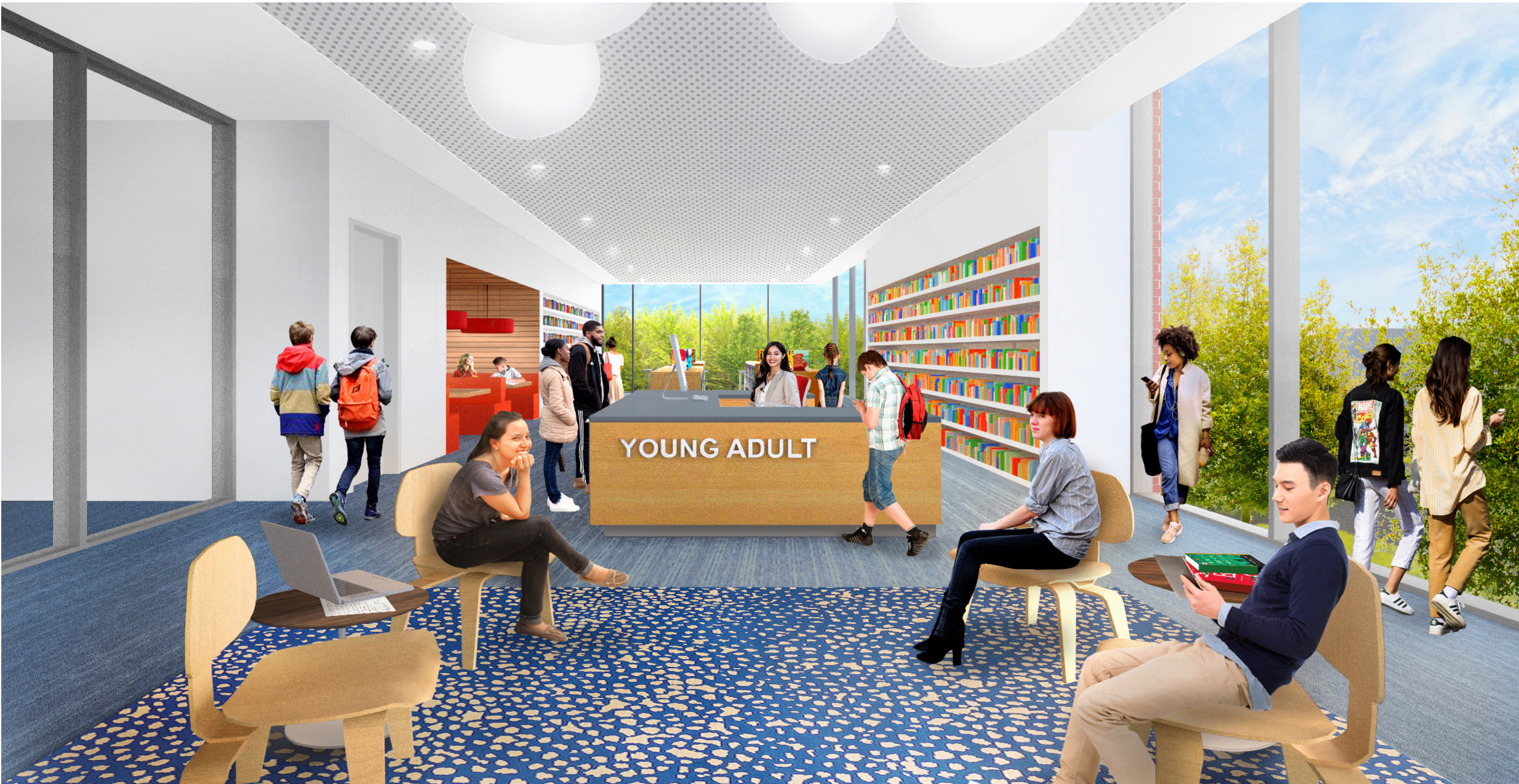
→ View of Young Adult Wing