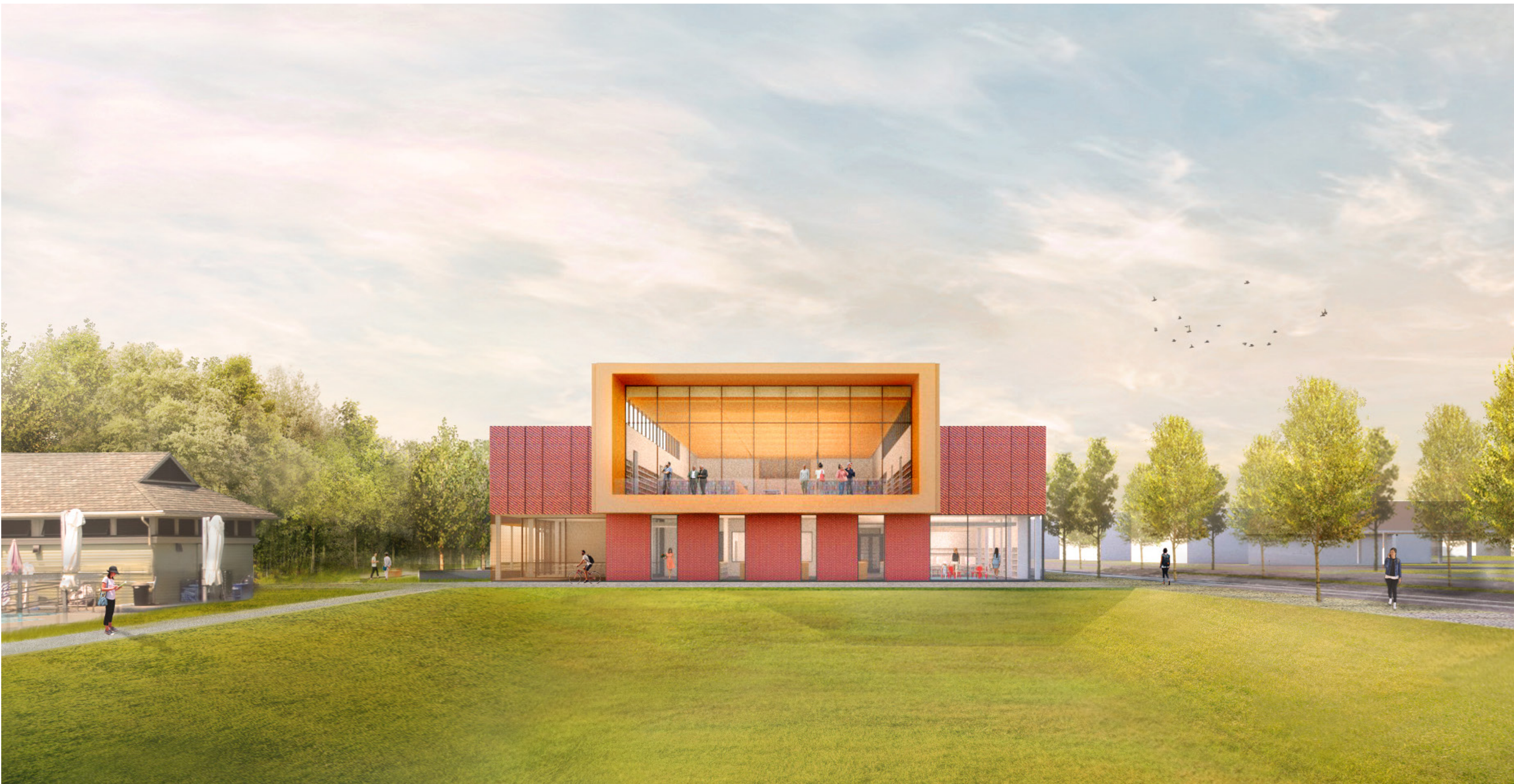
→ View from Underwood Lawn facing west