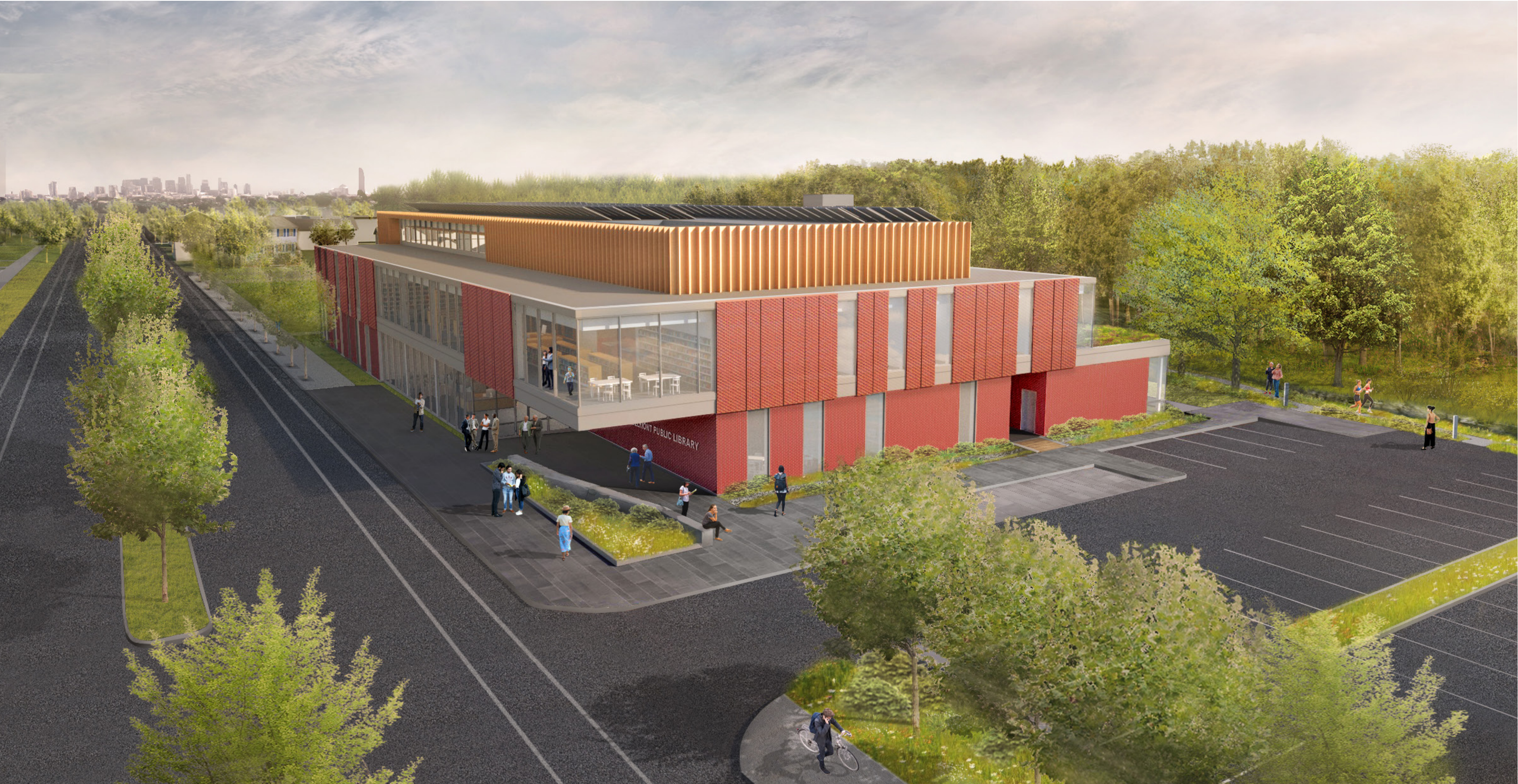
↑ Site Plan ← Aerial view looking southeast