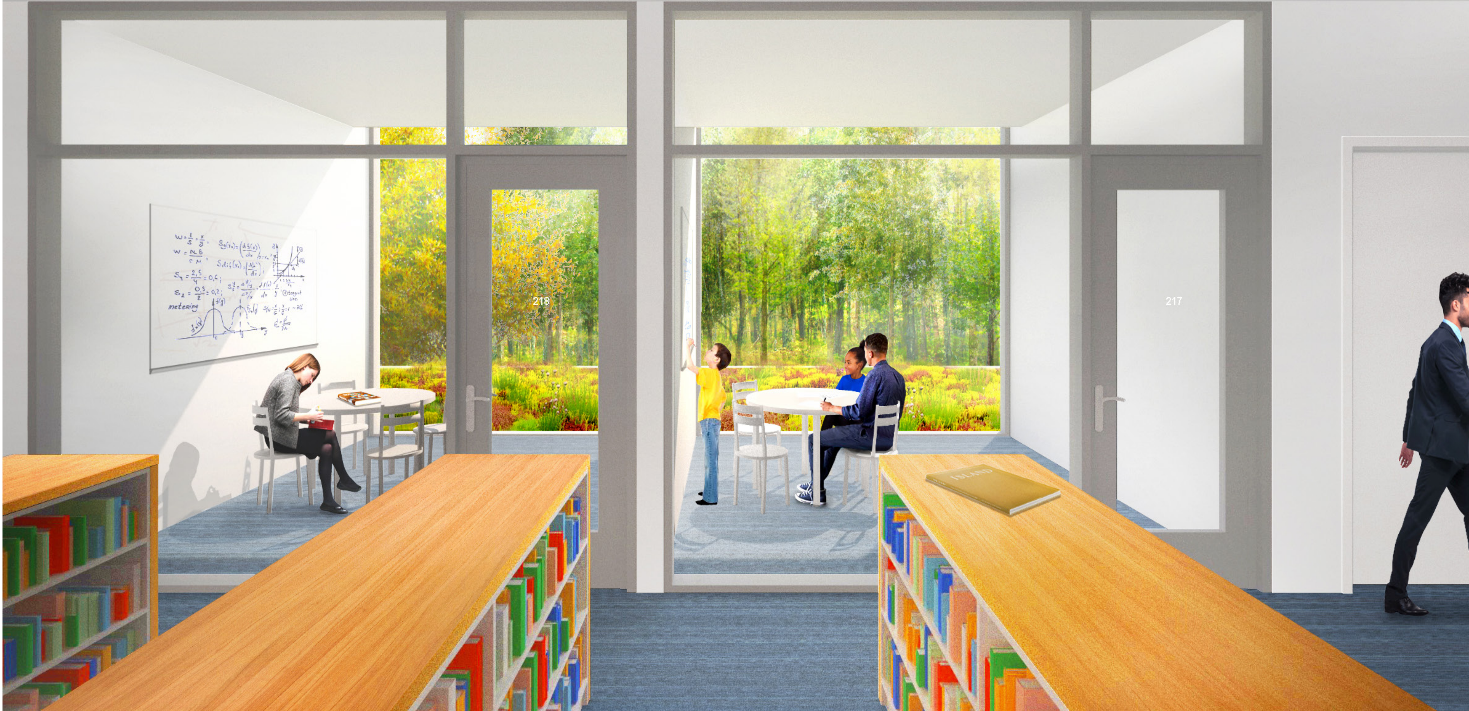
↑ View of Quiet Study Rooms overlooking the green roof and Wellington Brook