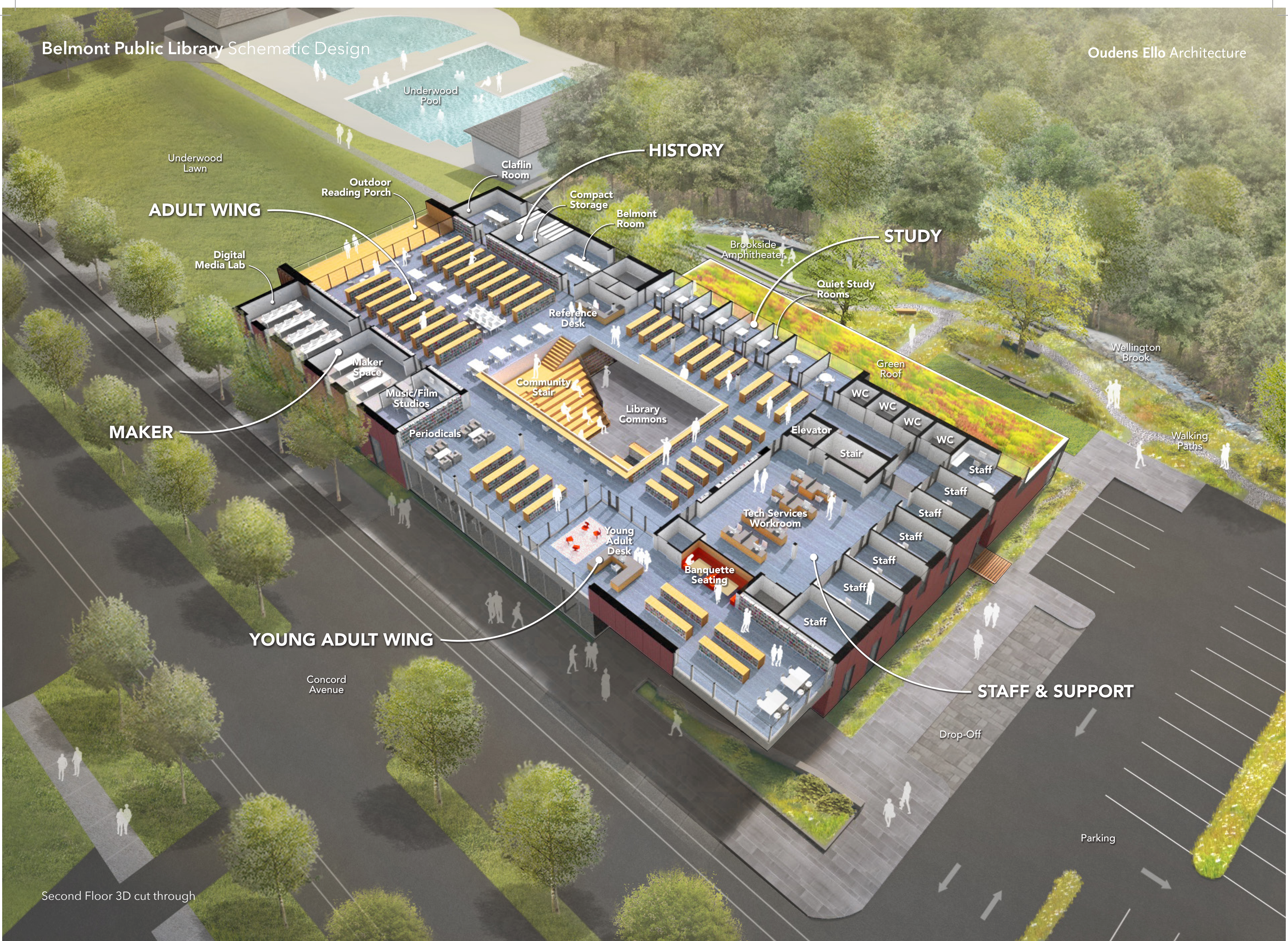
Second Floor 3D cut through