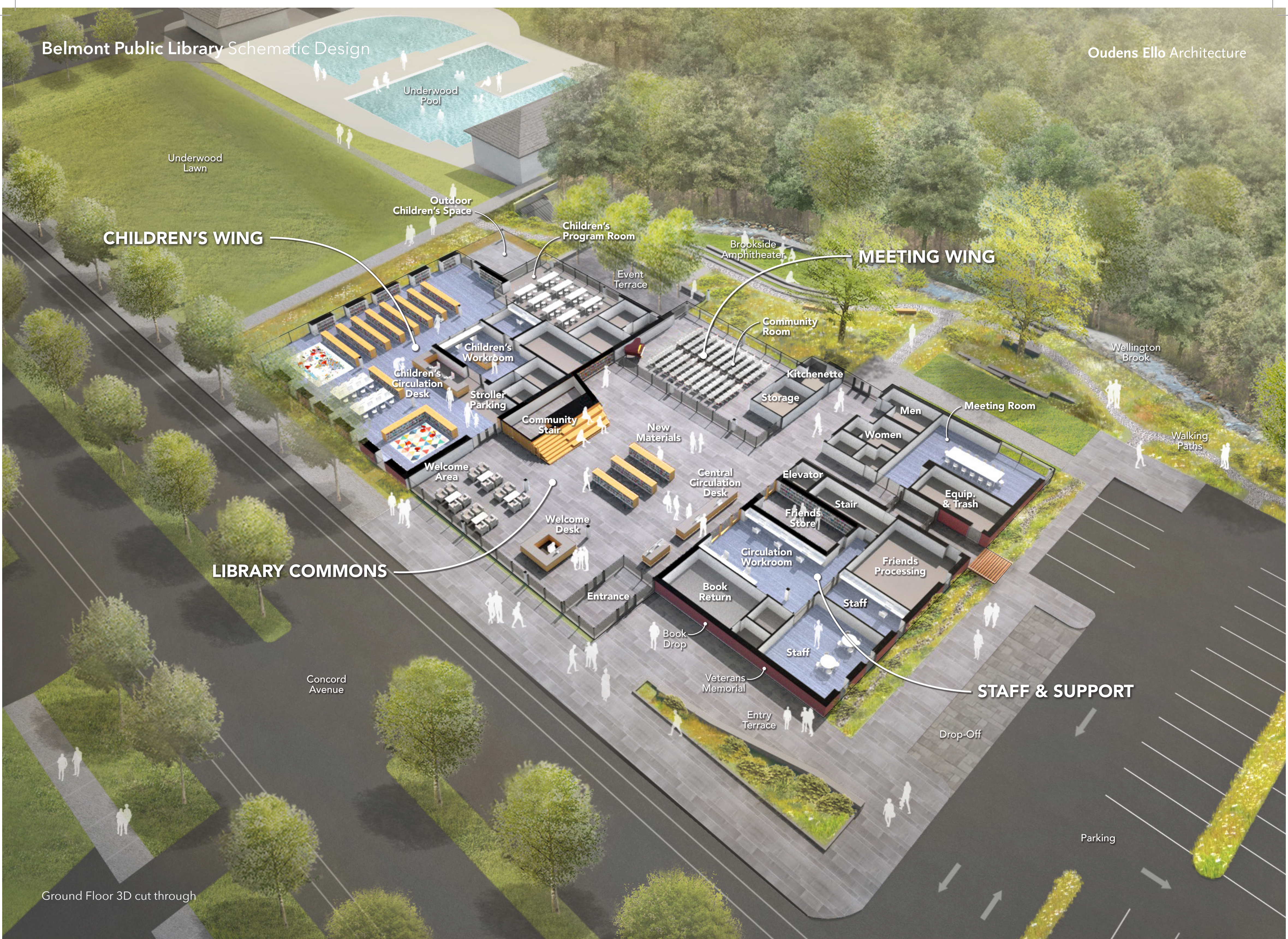
Belmont Public Library Schematic Design Oudens Ello Architecture CHILDREN'S WING LIBRARY COMMONS MEETING WING STAFF & SUPPORT Ground Floor 3D cut through Underwood Lawn Underwood Pool Outdoor Children's Space Children's Program Room Event Terrace Brookside Amphitheater Children's Workroom Children's Circulation Desk Stroller Parking Community Stair Welcome Area Welcome Desk New Materials Central Circulation Desk Community Room Kitchenette Storage Men Women Meeting Room Equip. & Trash Elevator Stair Friends Store Circulation Workroom Book Return Book Drop Veterans Memorial Entry Terrace Staff Friends Processing Wallington Brook Walking Paths Concord Avenue Parking Drop-Off