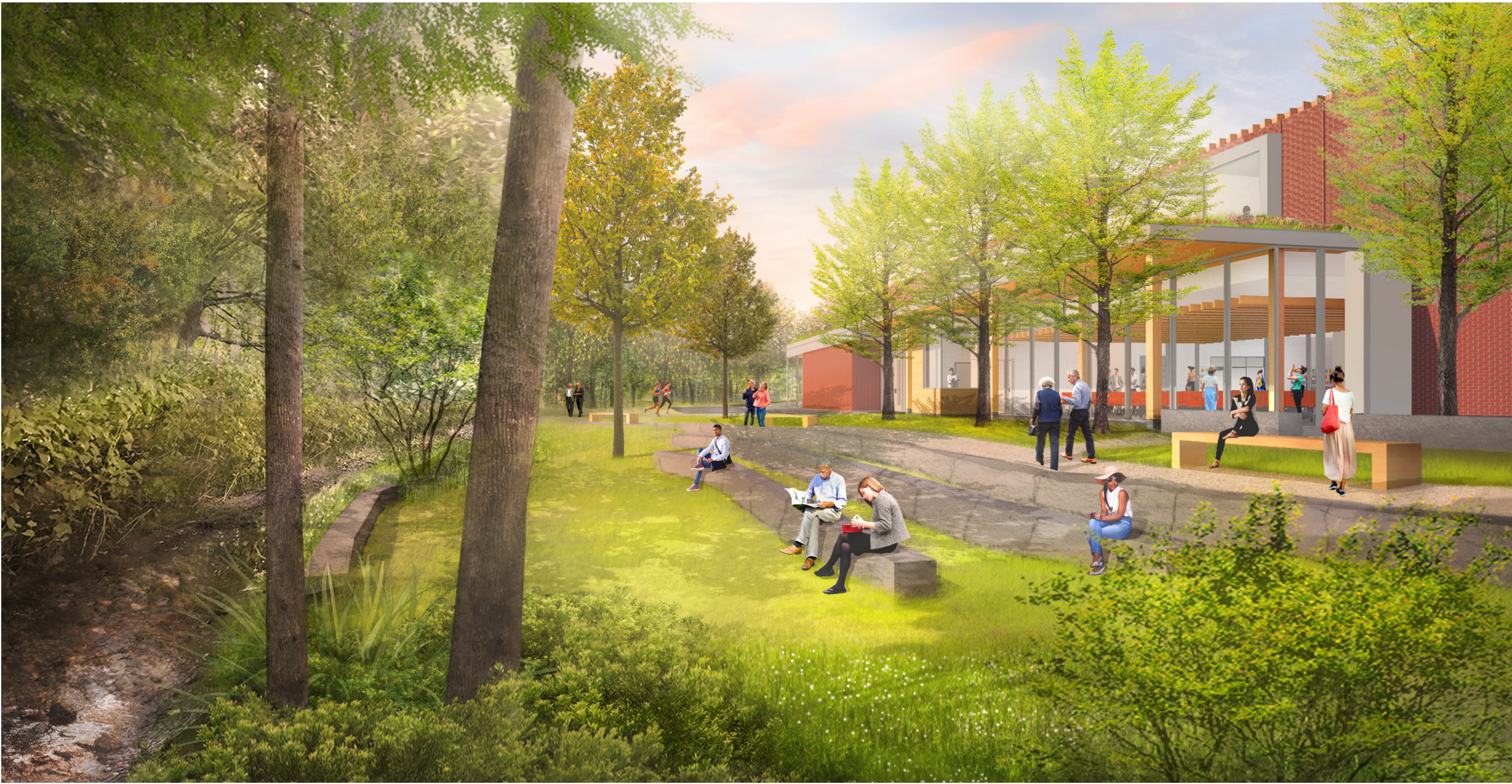
→ View of the Brookside Amphitheater and Wellington Brook landscape