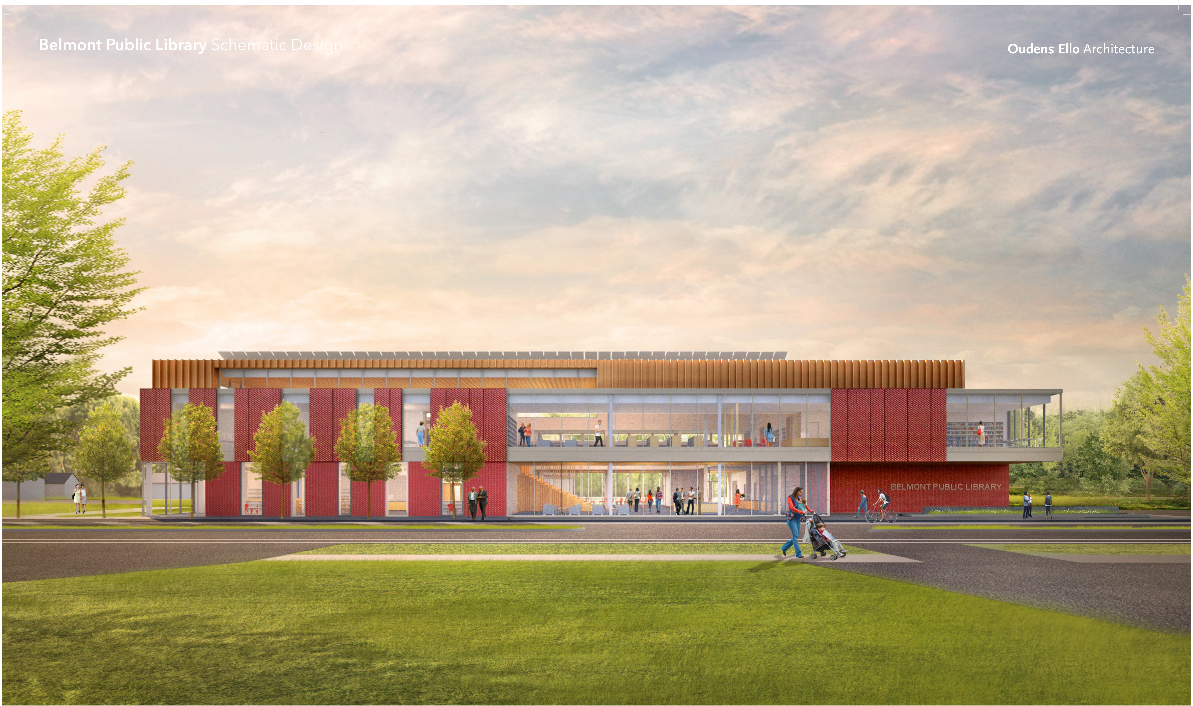
↑ View across Concord Avenue