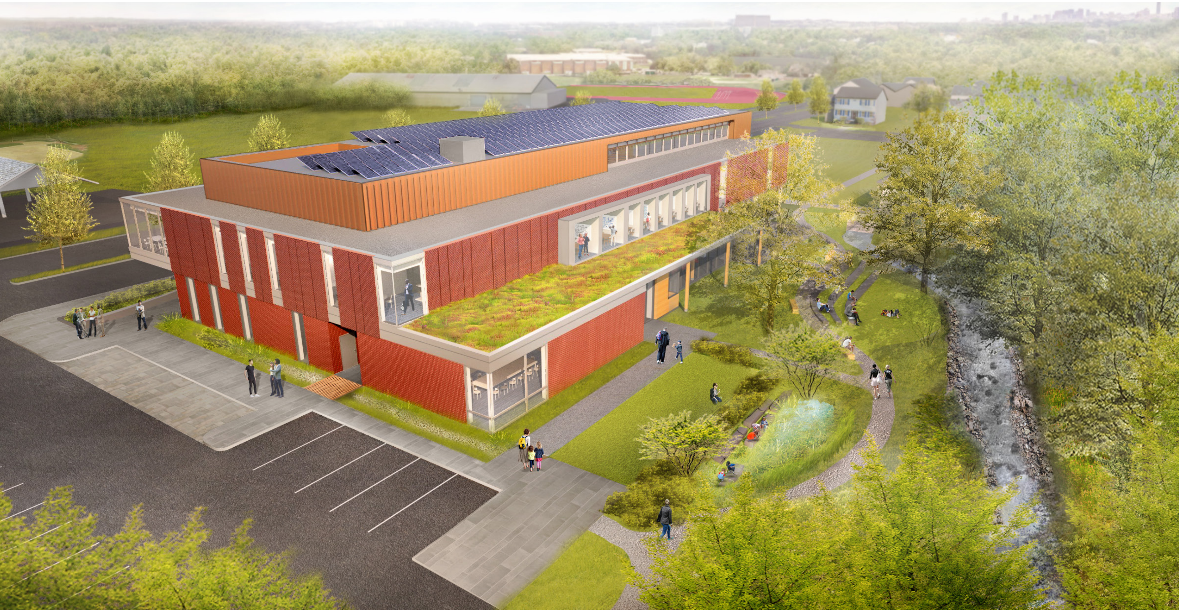
← Aerial view looking northeast