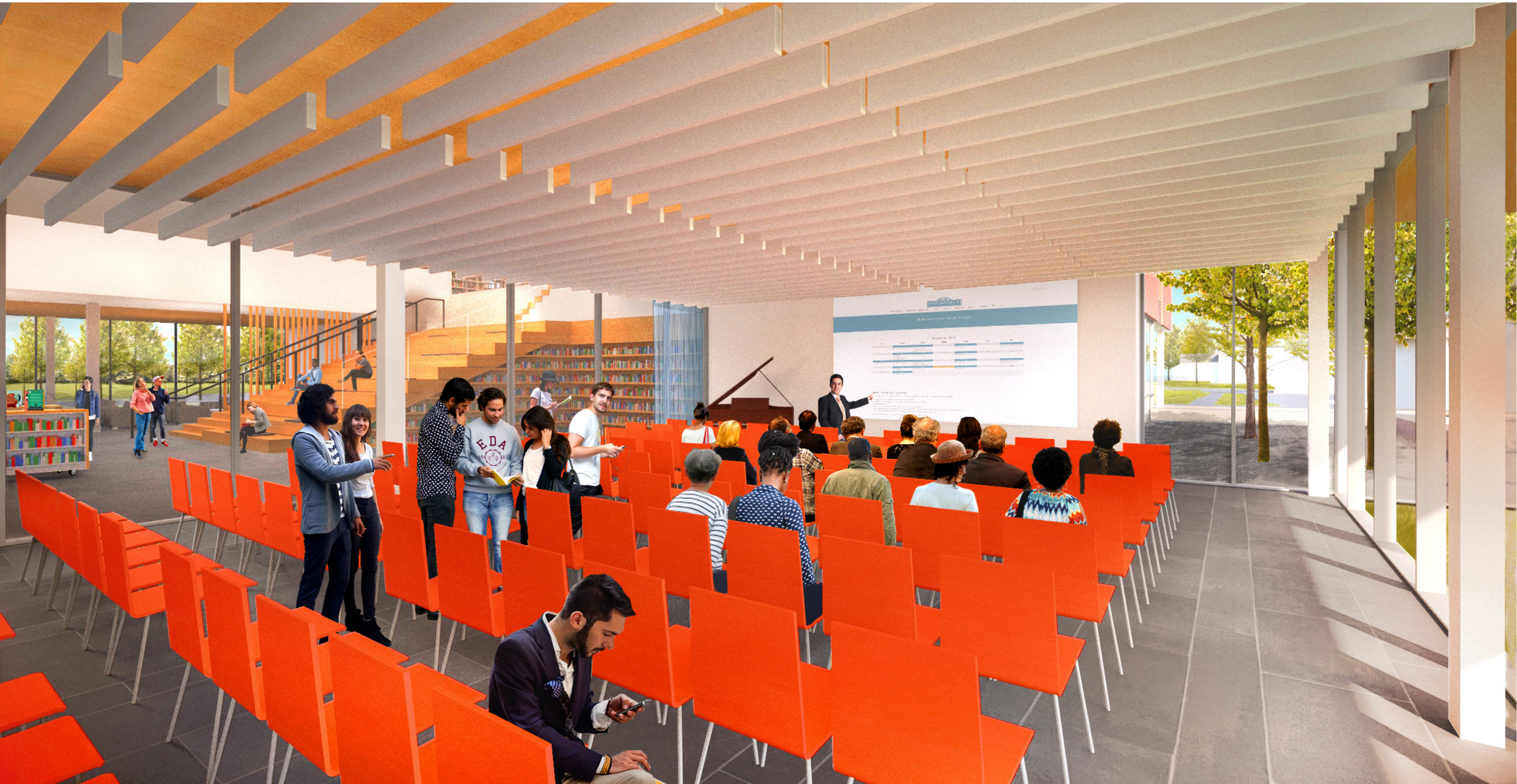
← View of the Community Room